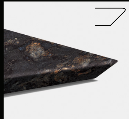
45° Rounded edge