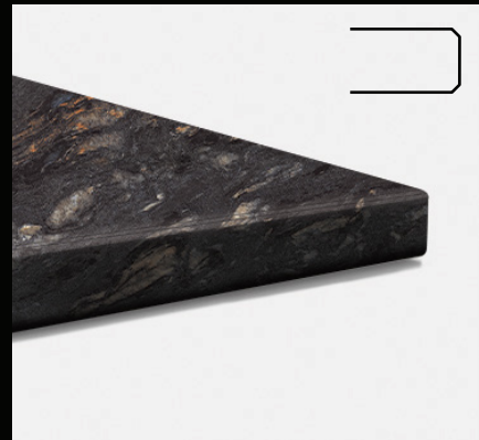
Square double straight edge