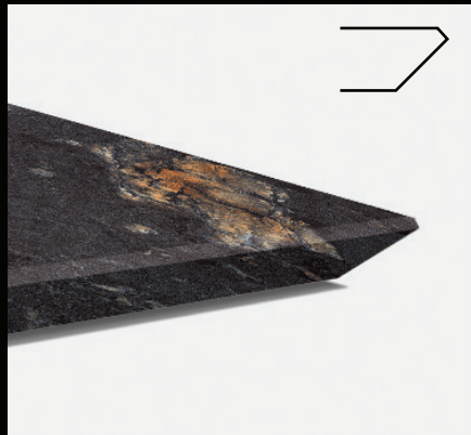
45° Square edge

Our porcelain slabs are crafted for those icons. Engineered with cutting-edge technology, refined through master craftsmanship, and perfected with timeless aesthetics, each slab is a testament to excellence.