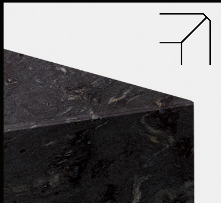
Square I-shaped edge