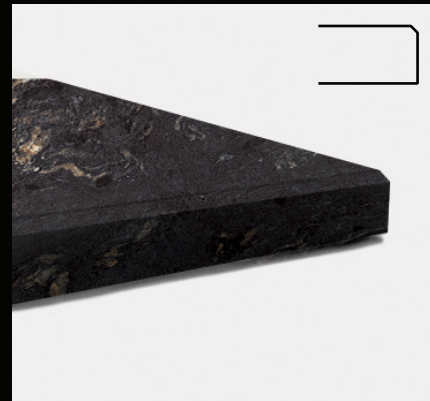
Square straight edge